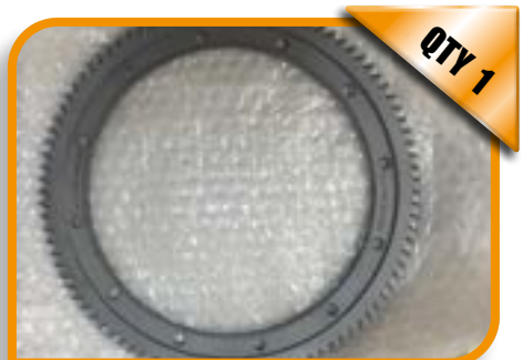
Toyota F3 Flywheel